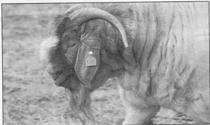
Pictured are some Boer Goats which will be featured at the 2010 Huon Show.

If you have any queries leading up to the Huon Show, please email rivendale@skymesh.com.au .